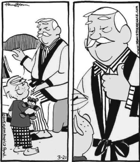
“DO YOU COUNT SHEEP TO GET TO SLEEP, GRAMPA?” “NOPE....I TALK TO THE SHEPHERD.”

WHEN THE BILL COLLECTOR CALLS We live in a society of indebtedness. In 2024, the average household debt was well over $100k. Our nation’s debt has climbed into the trillions of dollars. Being in debt seems to be an inescapable part of life for most of us. If not for getting a loan, most of us would have never been able to purchase a vehicle or a house. When it comes to our spiritual lives and service to God, how does the Lord feel about our indebtedness?