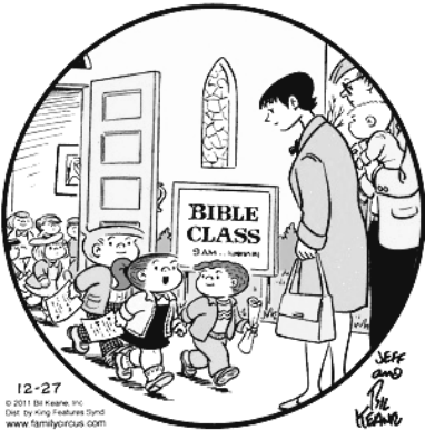
12-27 “We learned the fourth commandment: ‘Honor thy father and thy mother.’”

CHURCH FELLOWSHIP & BBQ CONTEST There is an All-Church Fellowship & BBQ Contest scheduled for Sunday, October 22 at 5:00 p.m. in the Fellowship Room. Mark your calendar and make plans to attend. There will be a sign up sheet to compete coming soon!